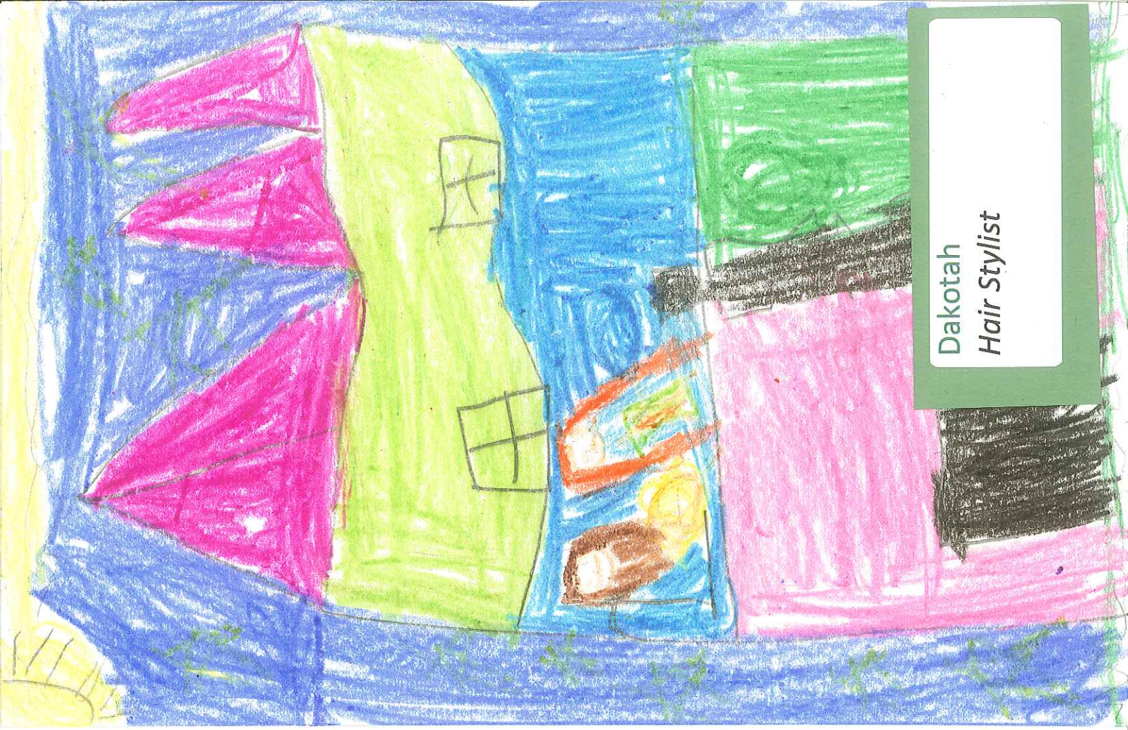
Dakotah Hair Stylist